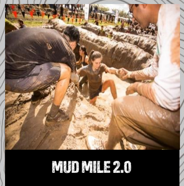
MUD MILE 2.0