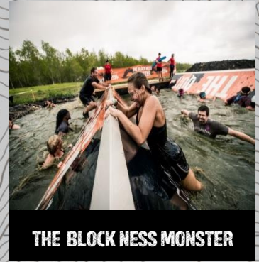
THE BLOCK NESS MONSTER